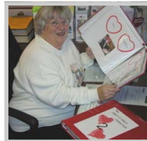
Check out the scrapbooks!