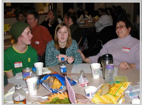
Jan 18, 2008: First Place: St. John's Episcopal Church

This is a great, intergenerational, family-oriented event. No matter how inept you may feel about trivia, the idea is to have fun and bond with your table mates. And you are bound to leave knowing more than when you came in! So gather the family, especially the grandkids over 12 who will help with those obscure answers!