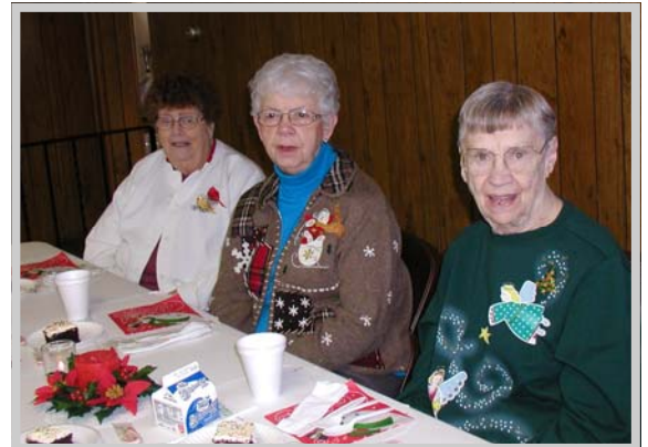
Join Friends for Lunch and Music! Three women from the Huxley meal site enjoy a special December meal and a Songbirds concert.