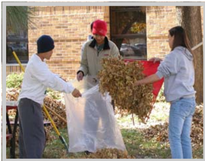
Heartland's Outreach Department coordinated several community groups who raked seniors' lawns this fall. A BIG THANK YOU to all rakers: Ames High Key Club, Boys with Rakes (ISU Birch/Welch/Roberts dorms), St Thomas Aquinas, Trinty Christian Reform, and Stonebrook Church.