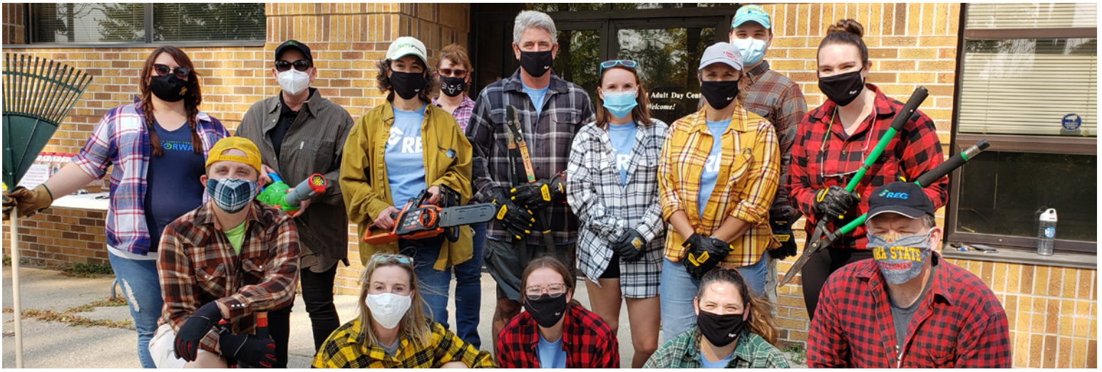
REG employees pause for a group photo.