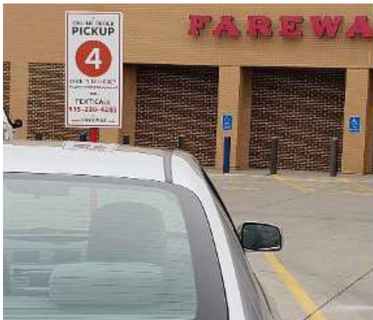
Volunteers will support program participants by picking up their ordered groceries.

If you or someone you know could benefit from this service, visit our website at heartlandseniorservice.com or call 515-233-2906. Program details are listed, including a Participation Application Form. To volunteer for this program, visit the same website or telephone RSVP at 515-292-8890.